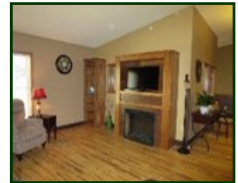
Main Living Space