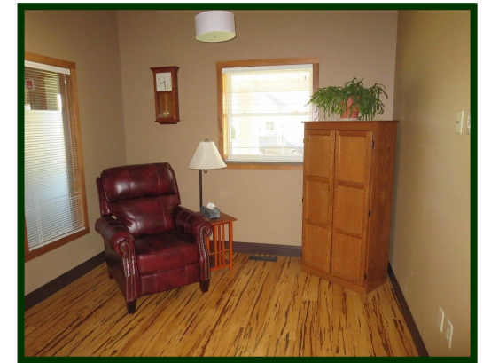
Leisure Space (Sitting Room)