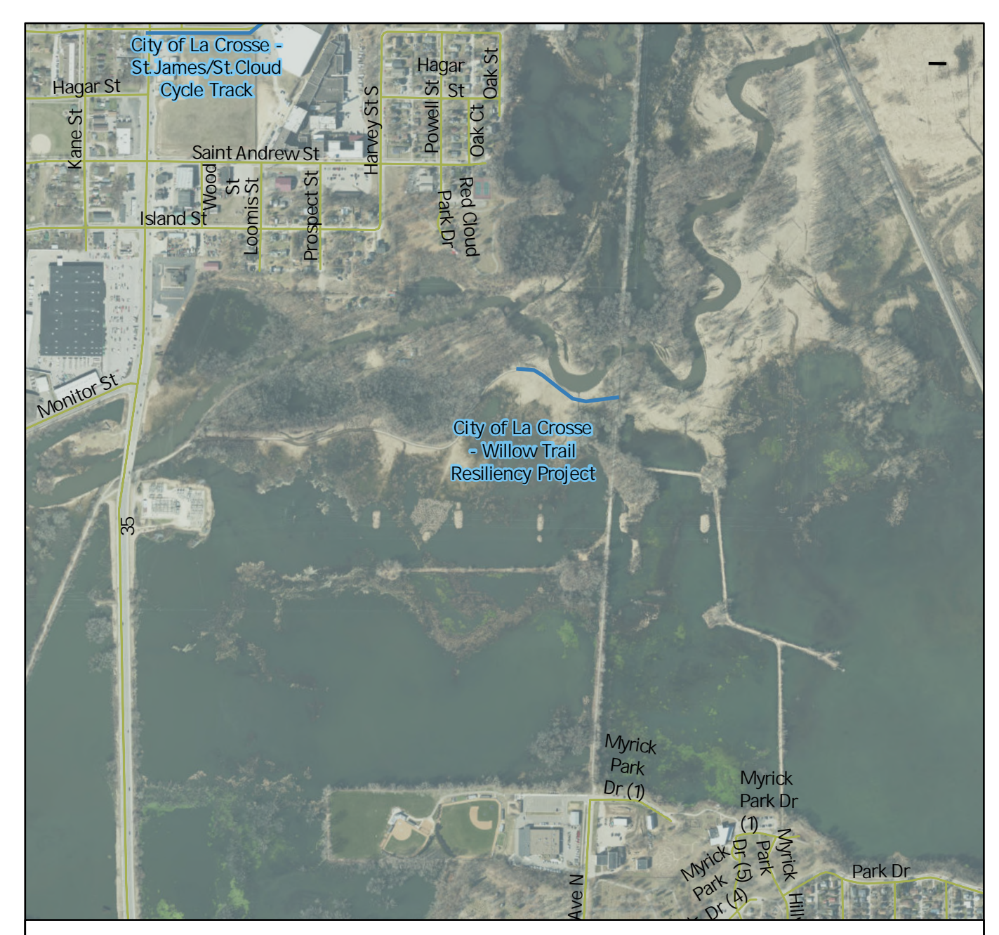
City Of La Crosse - Willow Trail Resiliency Project

Approximately 2,500 feet north of East Avenue North and Myrick Park Drive, extending to a point 3,500 feet west of 101 Lange Drive.