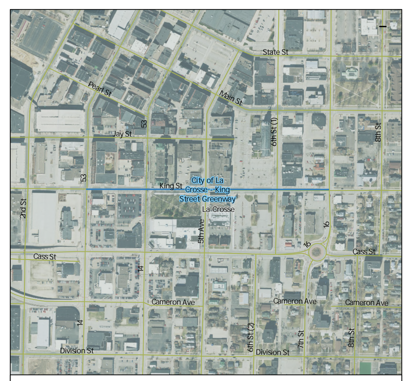
City of La Crosse - King Street Greenway Extension

King Street, beginning at 3rd Street South and extends to 7th Street South.