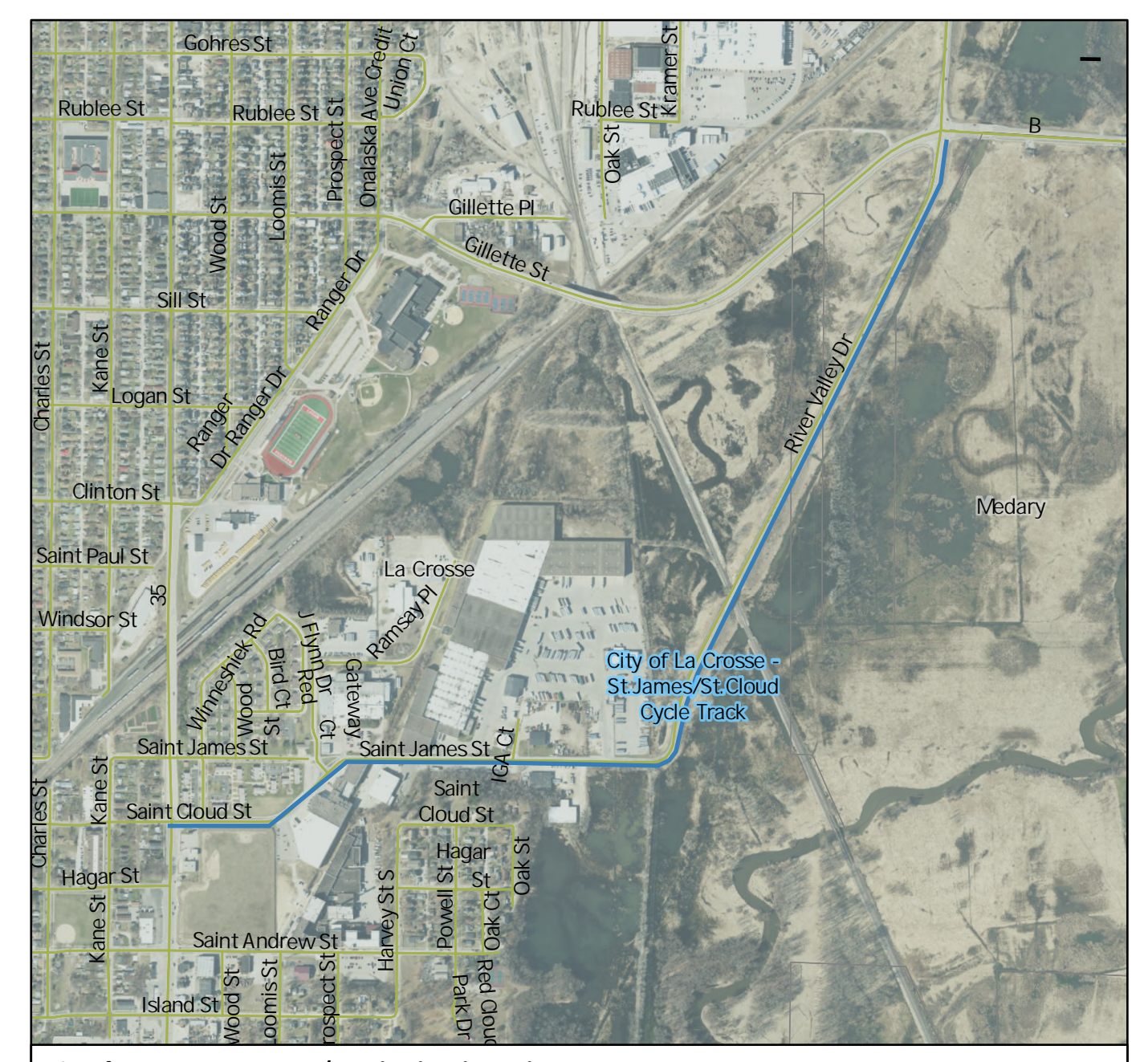
City of La Crosse - St. James / St. Cloud Cycle Track

Running along Saint James and Saint Cloud Street, beginning at George Street, continuing on River Valley Drive, up to Gillette Street.