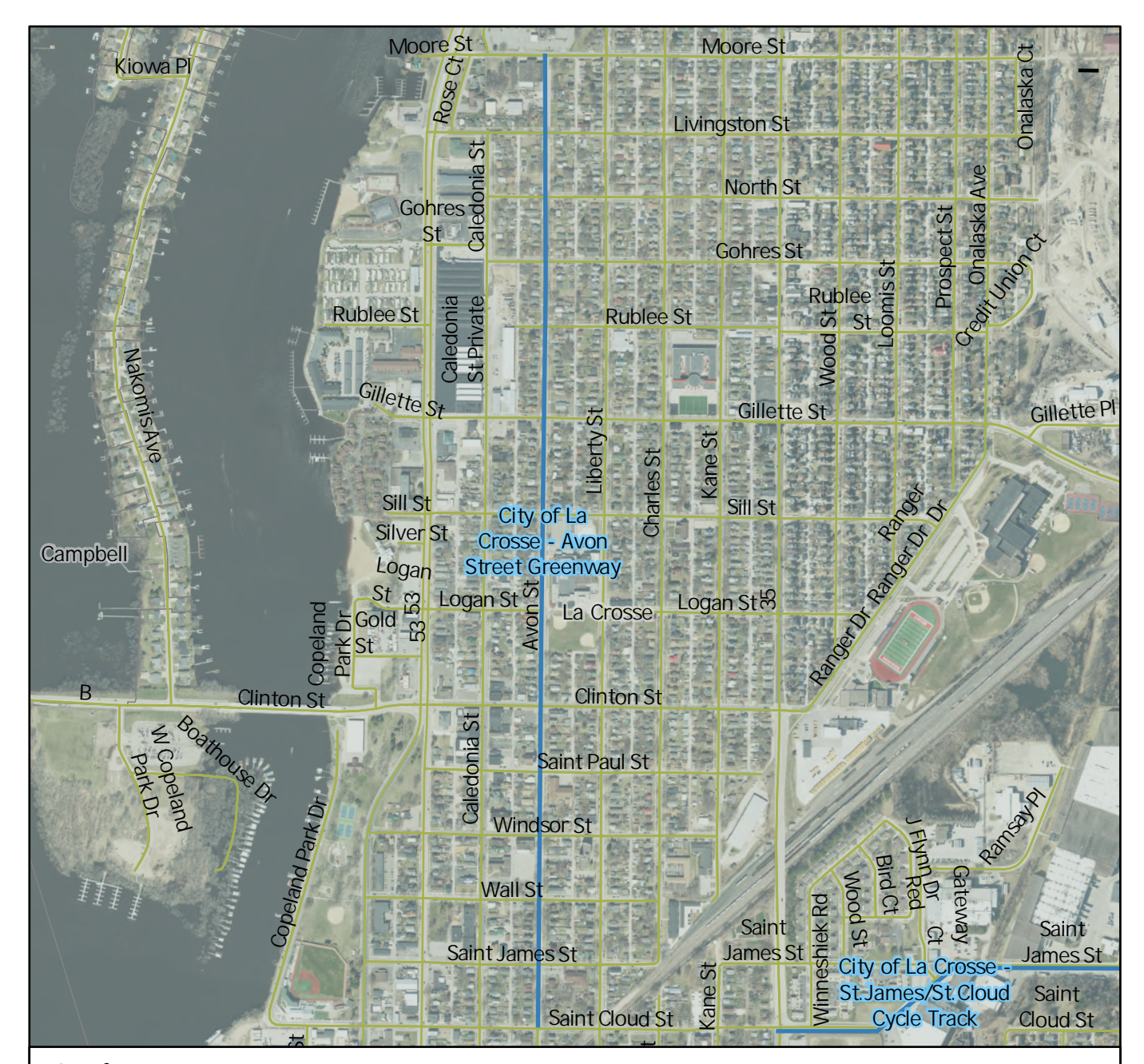
City of La Crosse - Avon Street Greenway

Avon Street, beginning at Saint Cloud Street and extends to Moore Street.