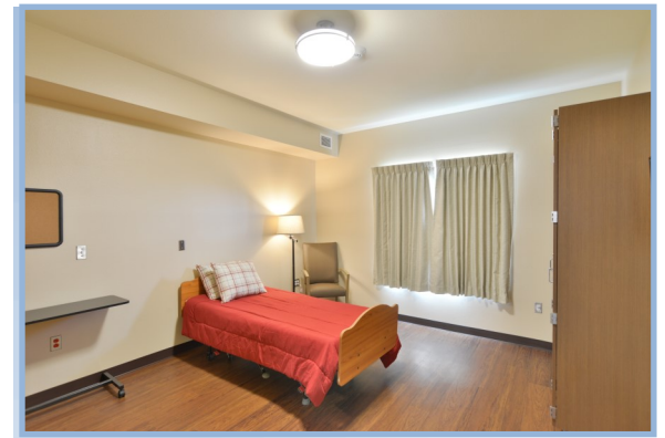
Private bedroom with bathroom