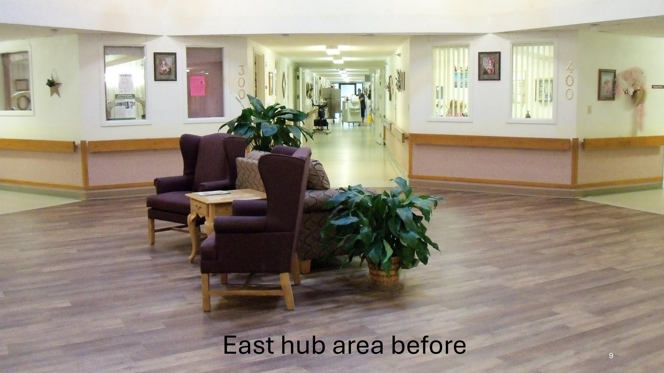
East hub area before