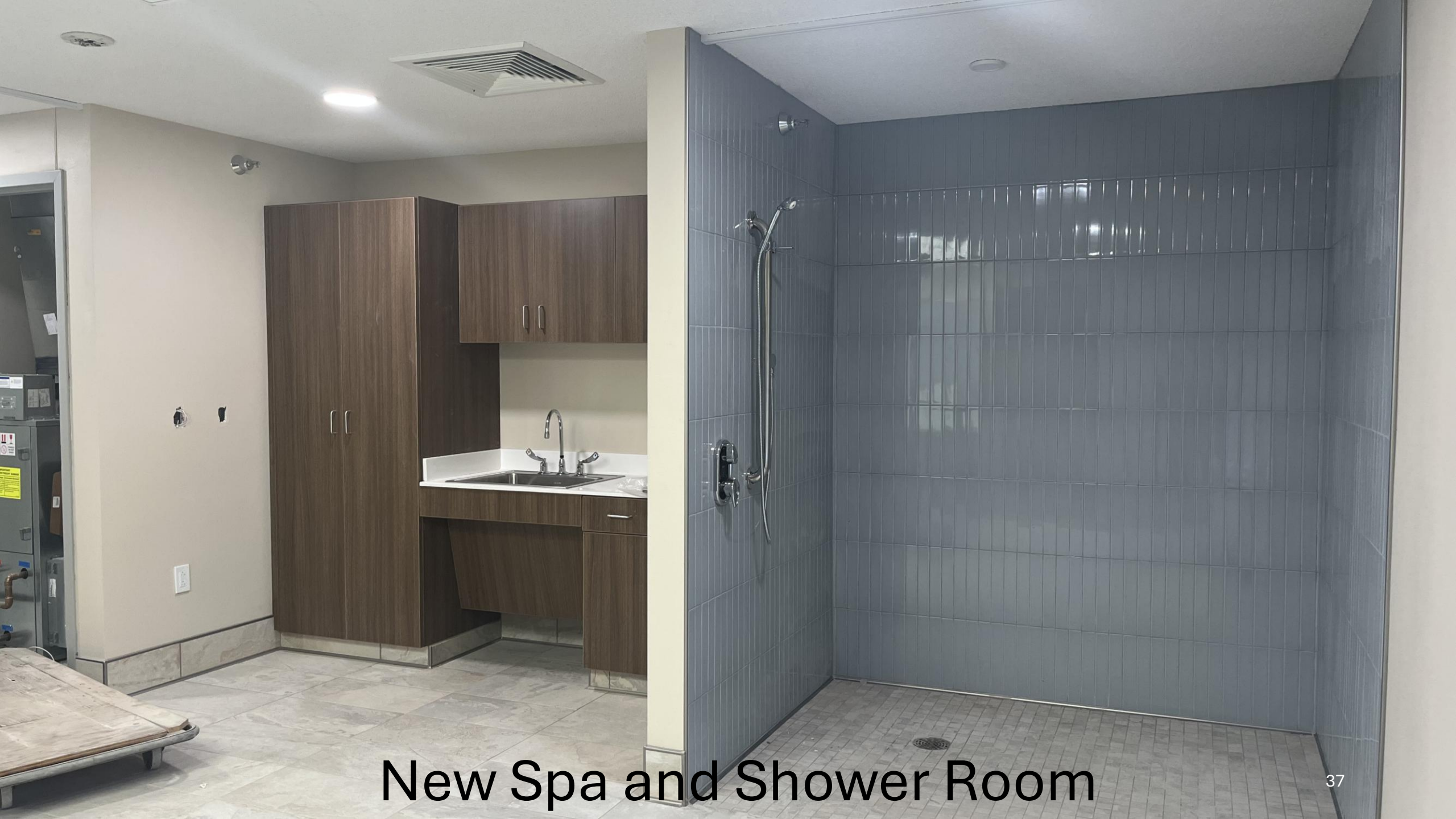
New Spa and Shower Room