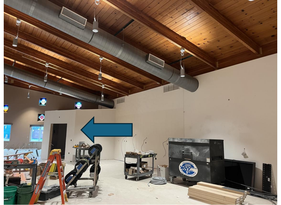
Life Center Entrance