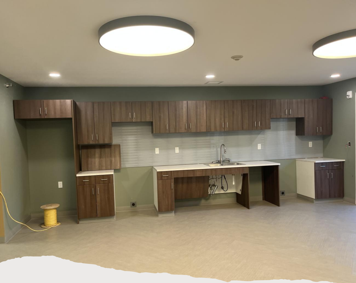
Common Kitchen/Dining Area