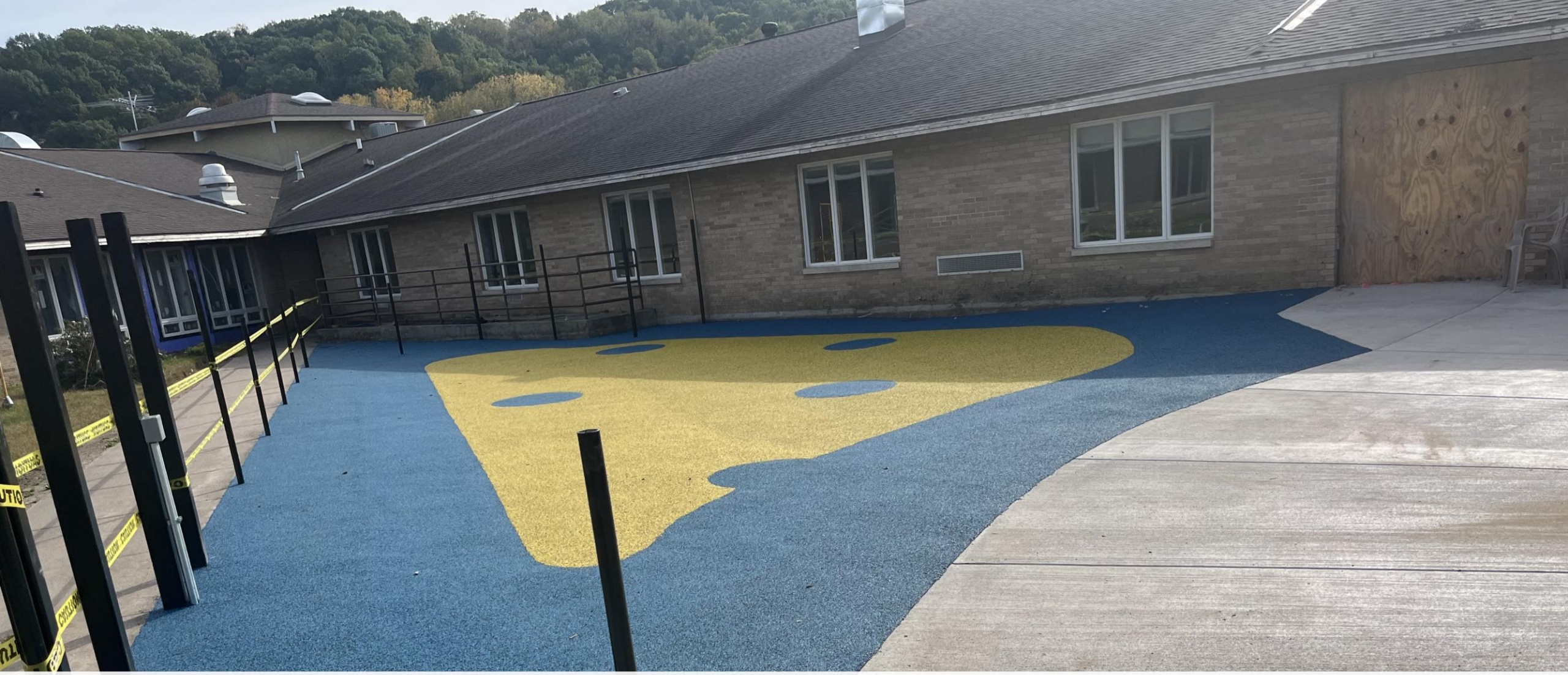
Outdoor play area