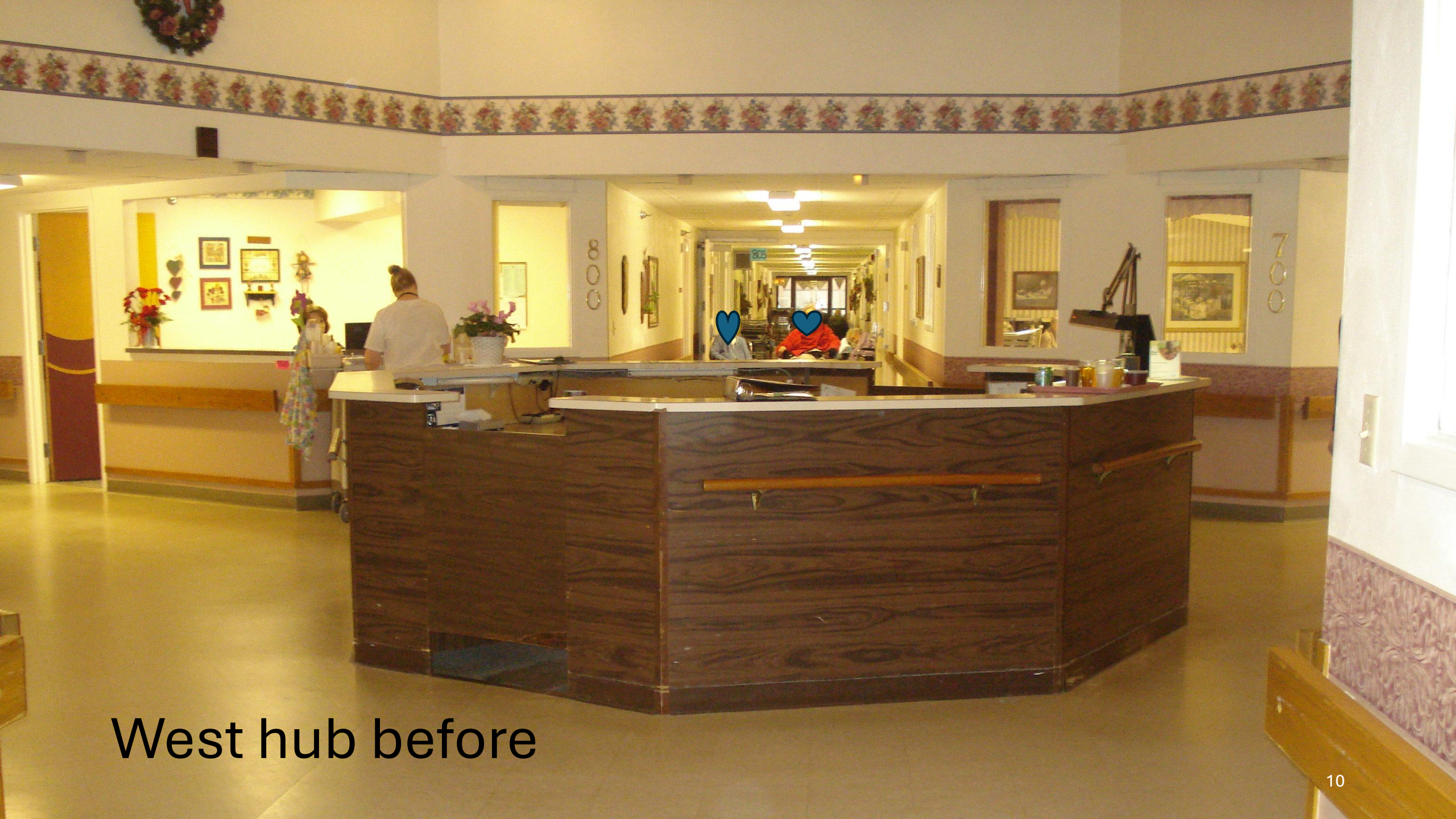
West hub before