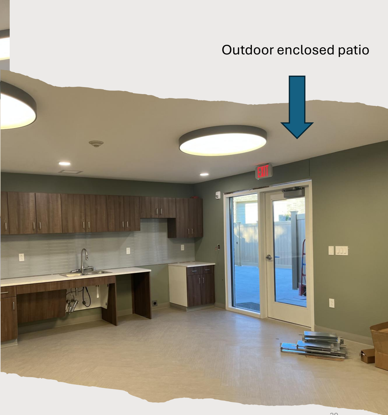
Outdoor enclosed patio