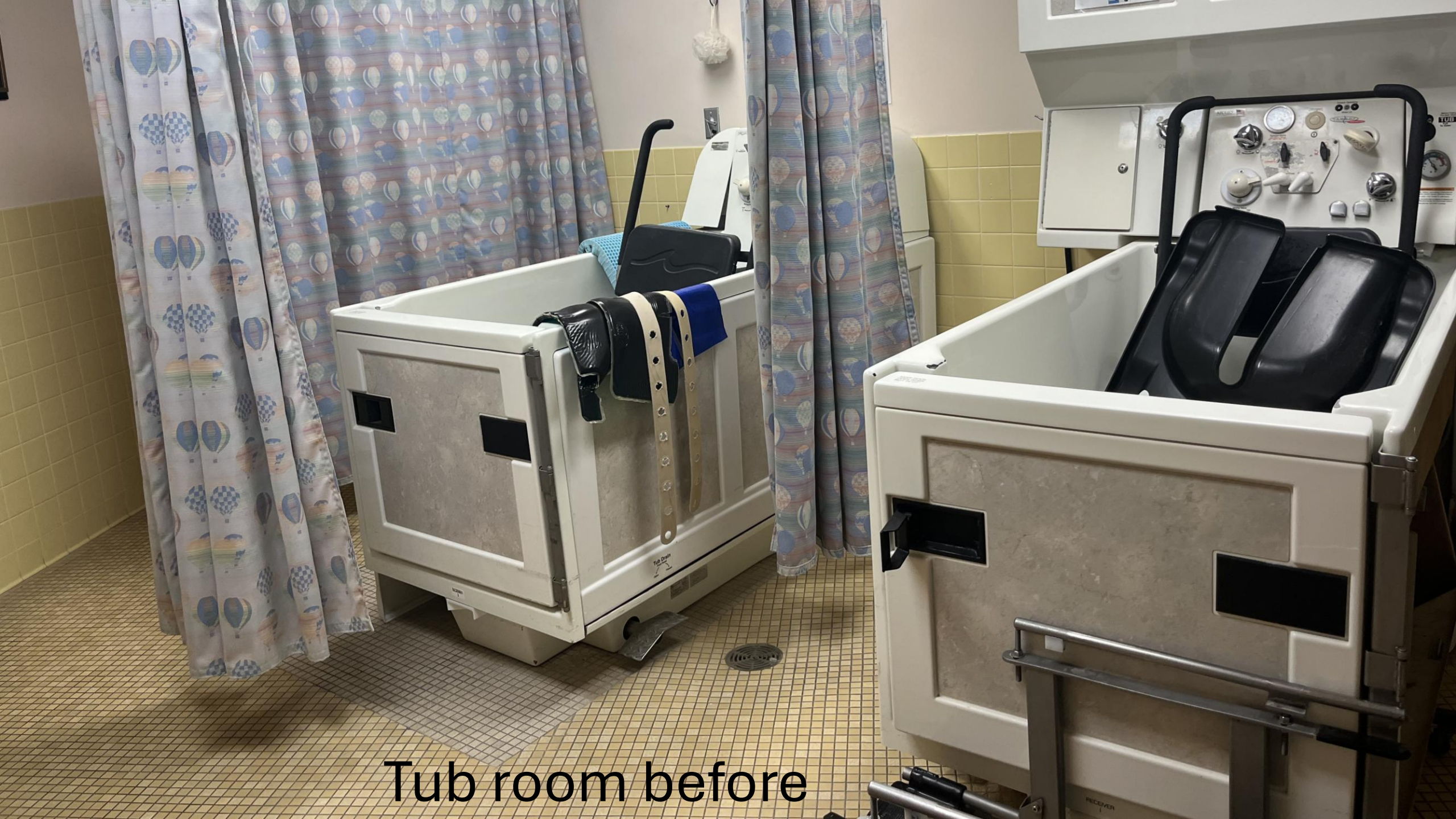
Tub room before