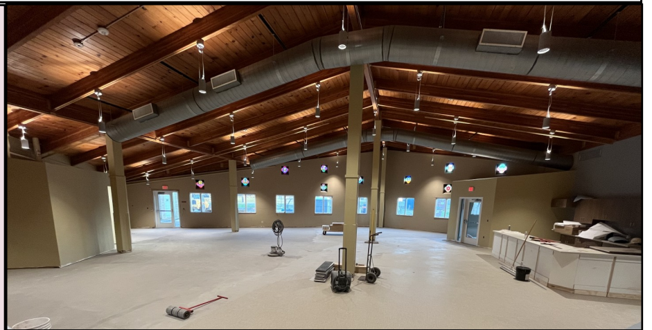
Above: A look inside the Life Center during construction. This larger space will be used primarily for the YWCA childcare program.

As Hillview Life Center prepares to open its doors, community volunteers will play a key role in bringing this vision to life.